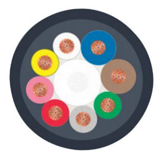
Wire cross section